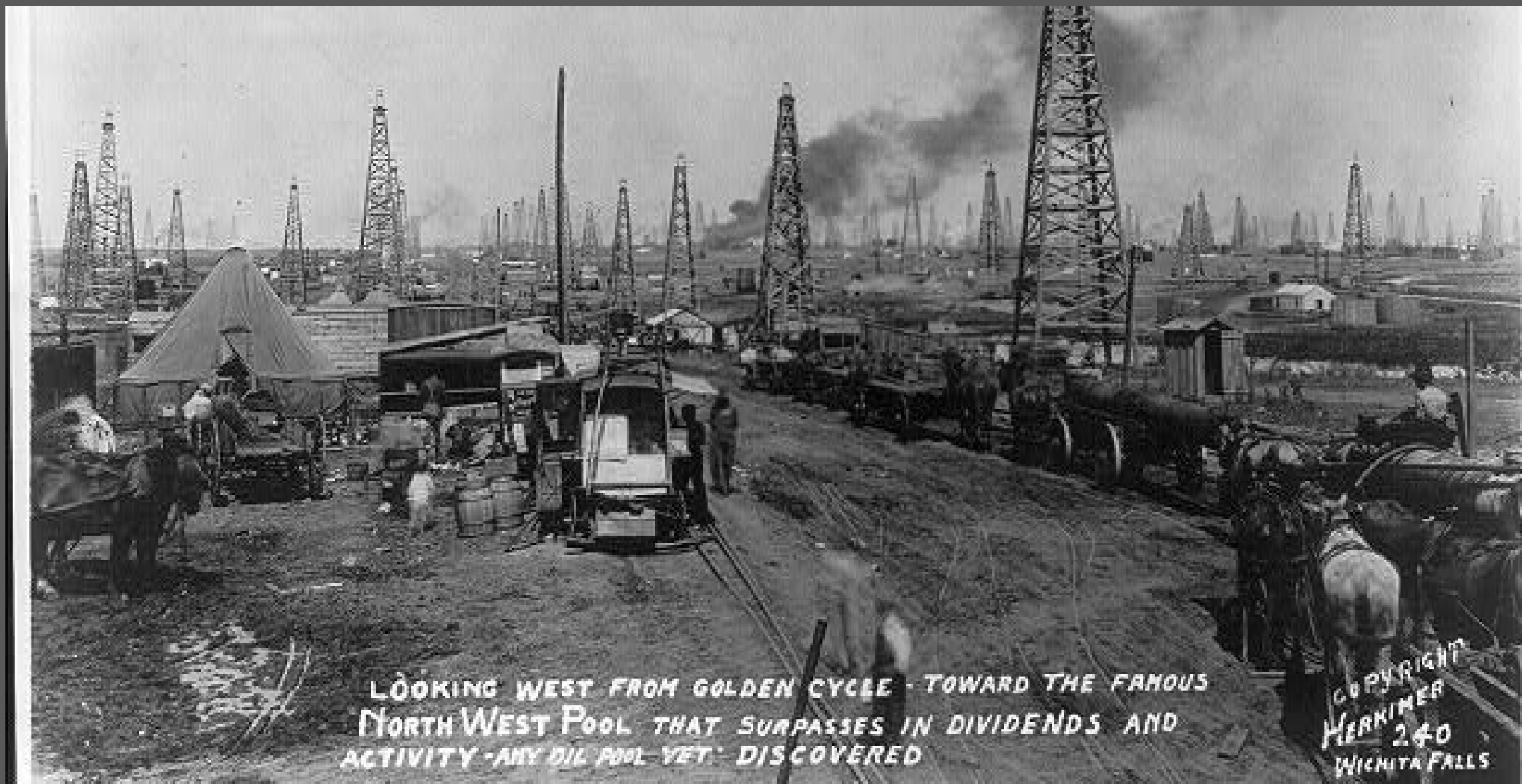
LOOKING WEST FROM GOLDEN CYCLE - TOWARD THE FAMOUS NORTH WEST POOL THAT SURPASSES IN DIVIDENDS AND ACTIVITY - ANY OIL POOL YET - DISCOVERED