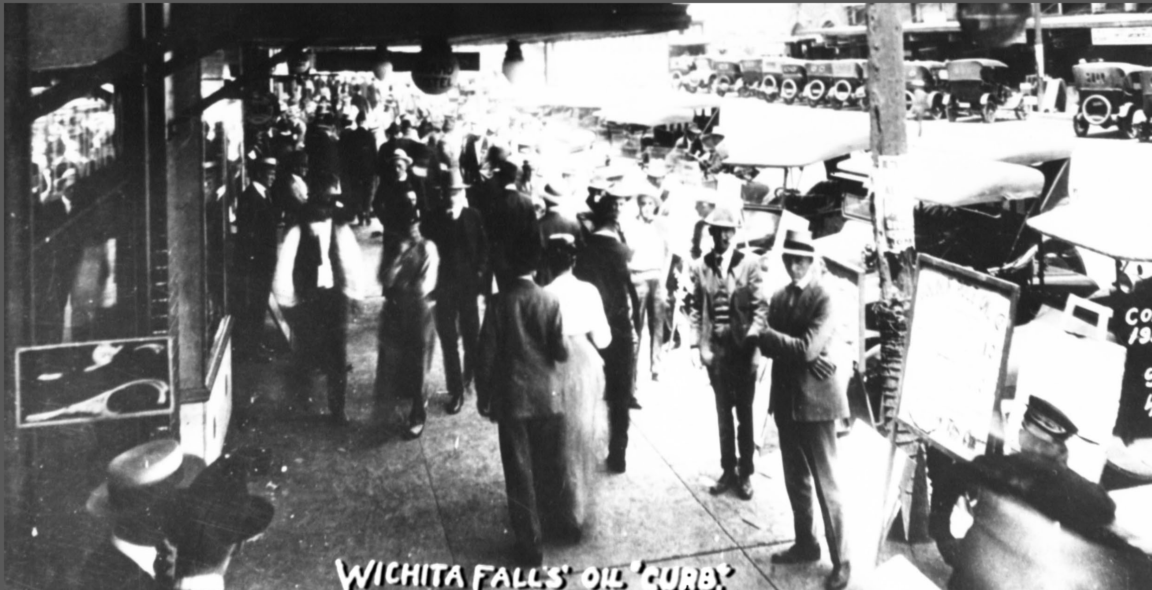
WICHITA FALLS' OIL 'CURB'