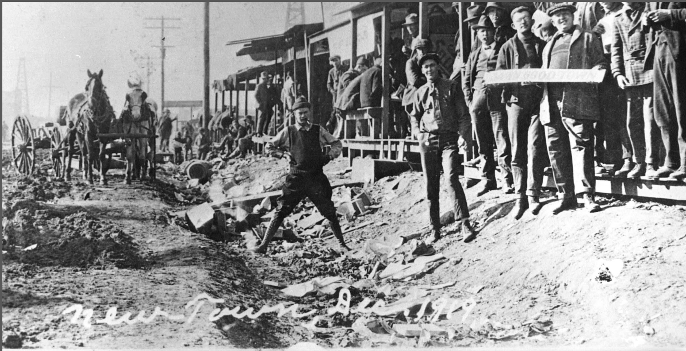
New Town, Alaska 1919